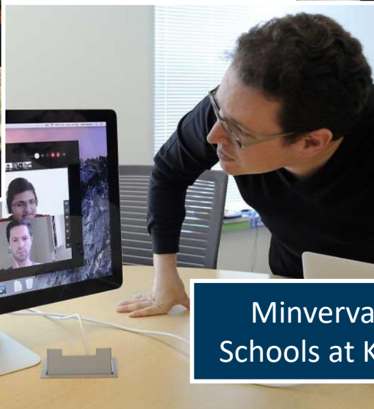
Minerva Schools at KGI