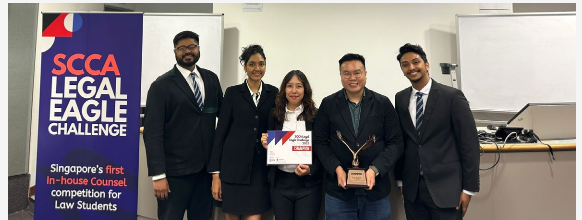
SCCA LEGAL EAGLE CHALLENGE