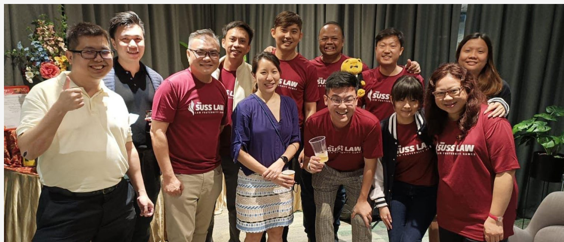
LAW FRATERNITY GAMES