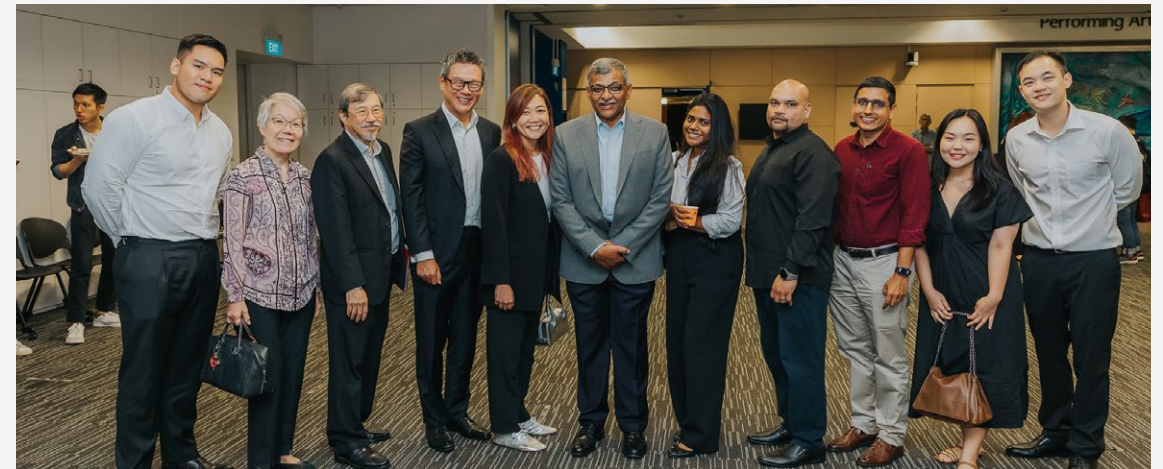
A TALK WITH THE HONOURABLE THE CHIEF JUSTICE SUNDARESH MENON