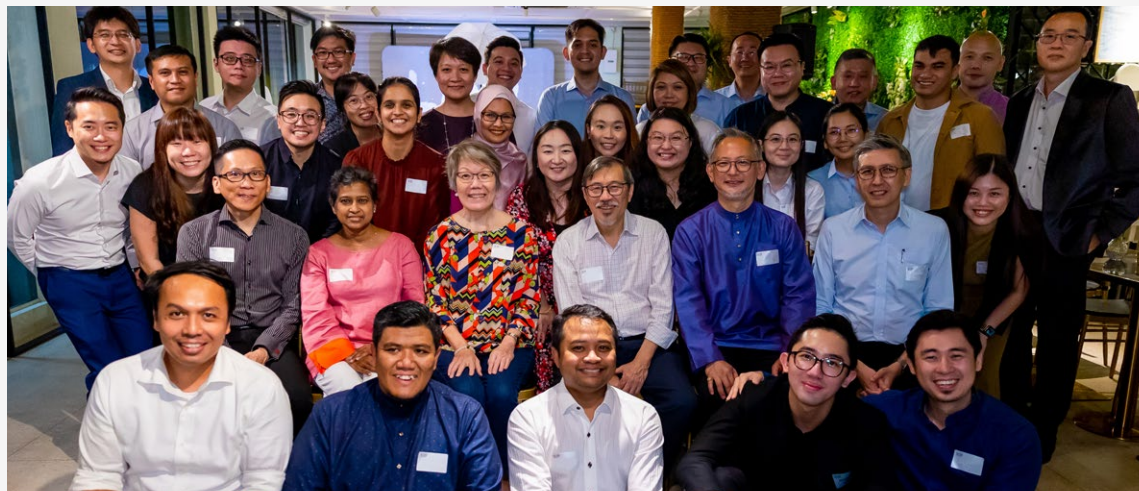
LAW ALUMNI EVENT