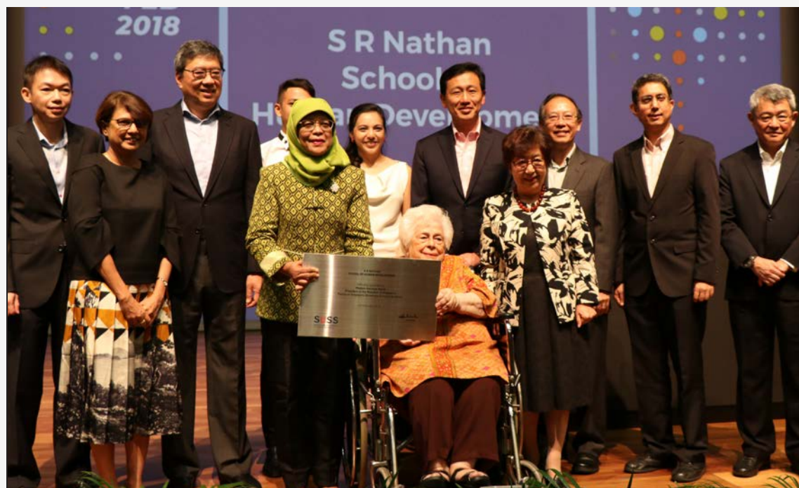
NSHD RENAMING EVENT