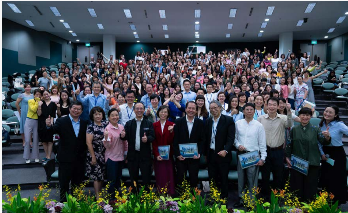
EARLY CHILDHOOD EDUCATION CHINESE SYMPOSIUM