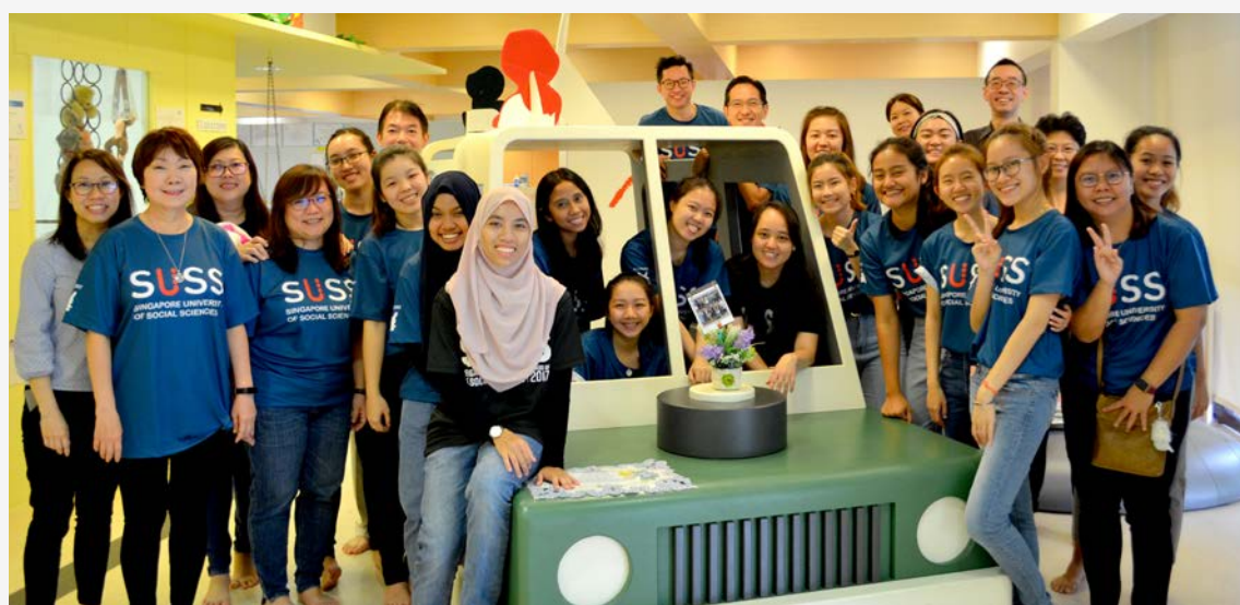
NSHD COMMUNITY OUTREACH — AWWA KINDLE GARDEN