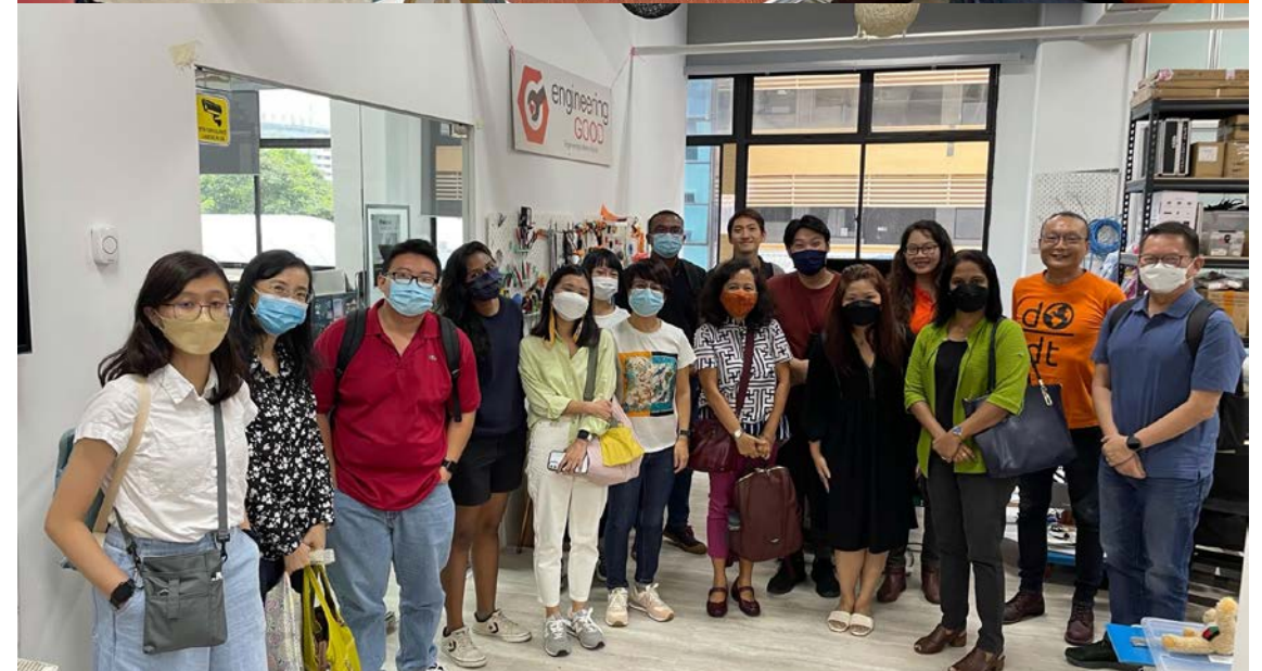
VISIT TO 'ENGINEERING GOOD' BY STUDENTS FROM THE NON-PROFIT MANAGEMENT PROGRAMME