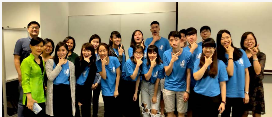
FACULTY AND ALUMNI FROM THE GERONTOLOGY PROGRAMMES WELCOMED STUDENTS FROM THE EDUCATION UNIVERSITY OF HONG KONG