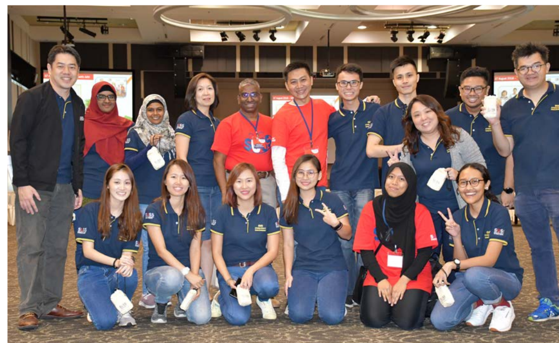
BCOU STUDENT ORIENTATION