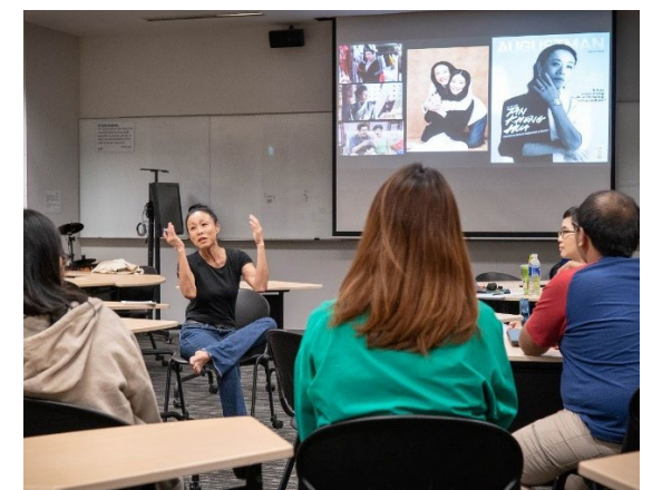
Actress Tan Kheng Hua visited the Singapore Film class and shared some of the differences between filming in Singapore and overseas, with anecdotes from her time filming shows like Phua Chu Kang and Crazy Rich Asians .